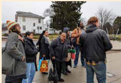
Visiting MU, winter2023 – district office retreat – office staff.