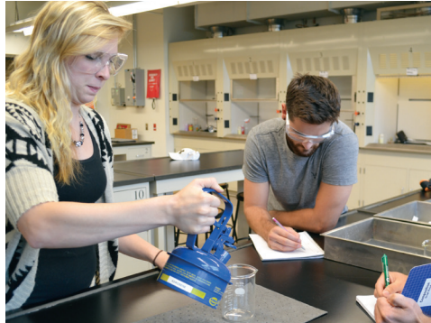
B.S. Occupational Safety & Environmental Health