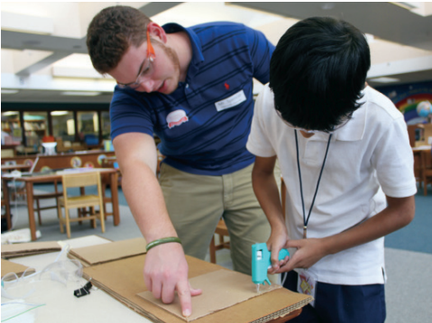
B.S. Ed. Technology & Engineering Education

Learn about our programs and the degrees we offer.