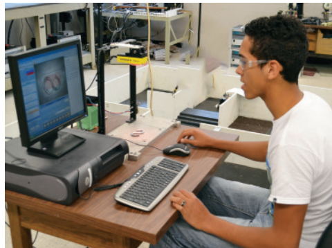
A.T. Applied Engineering & Technology