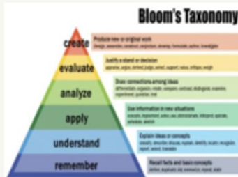
Figure 1: The top three levels of the Bloom's Taxonomy Model were used to reach higher levels of cognition and drive creativity.