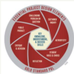
Figure 2: PBL elements implemented in this project.