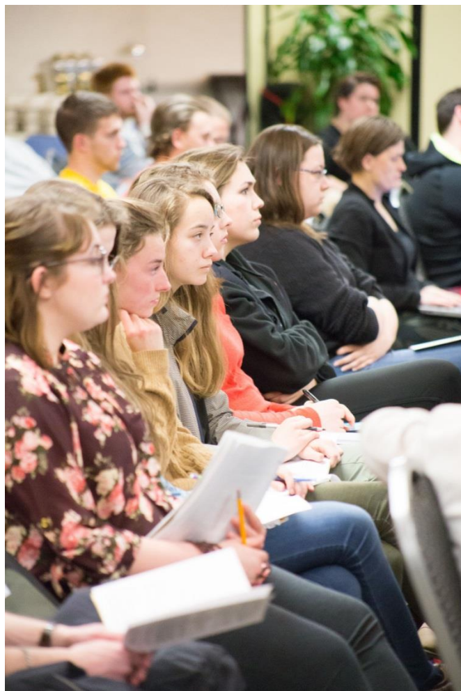
Conference Opening Night