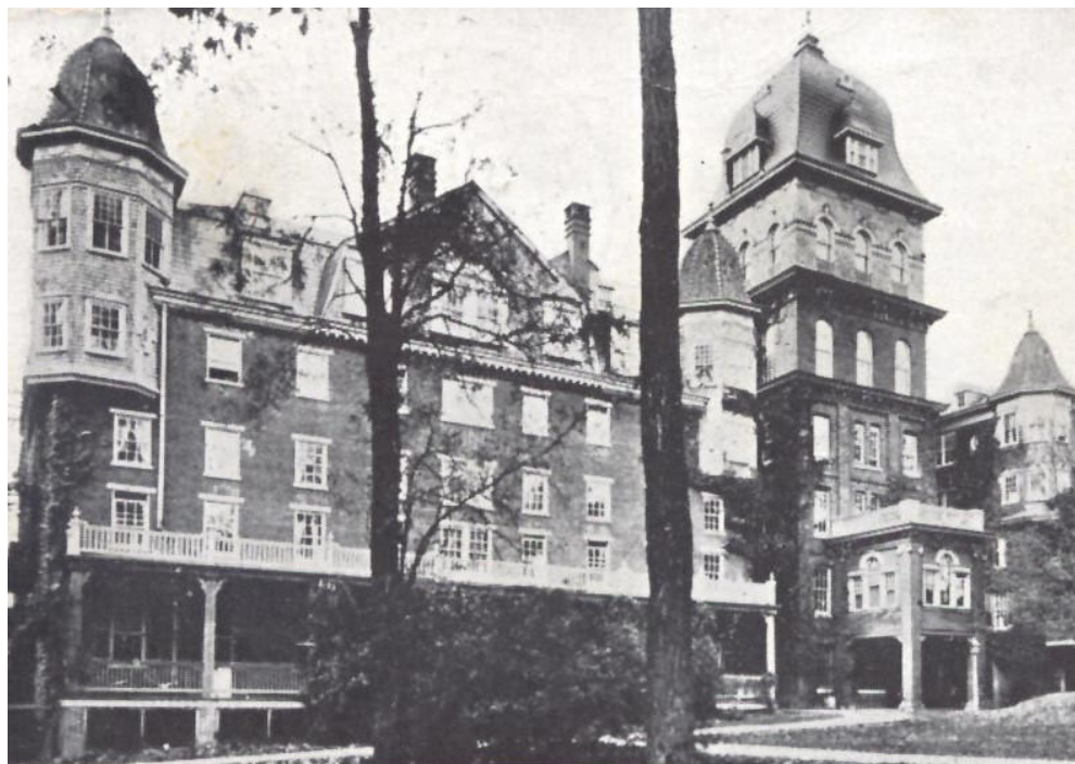
MAIN BUILDING, MILLERSVILLE NORMAL SCHOOL, 1908