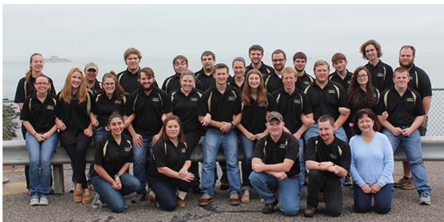
TEECA at MU members and advisors pose in Virginia Beach before boarding the bus for the long ride home.