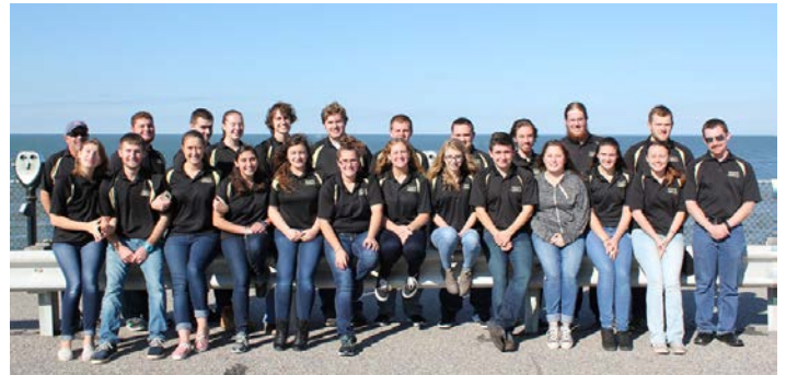
Students and faculty advisors at the TEECA Competition in Virginia Beach.