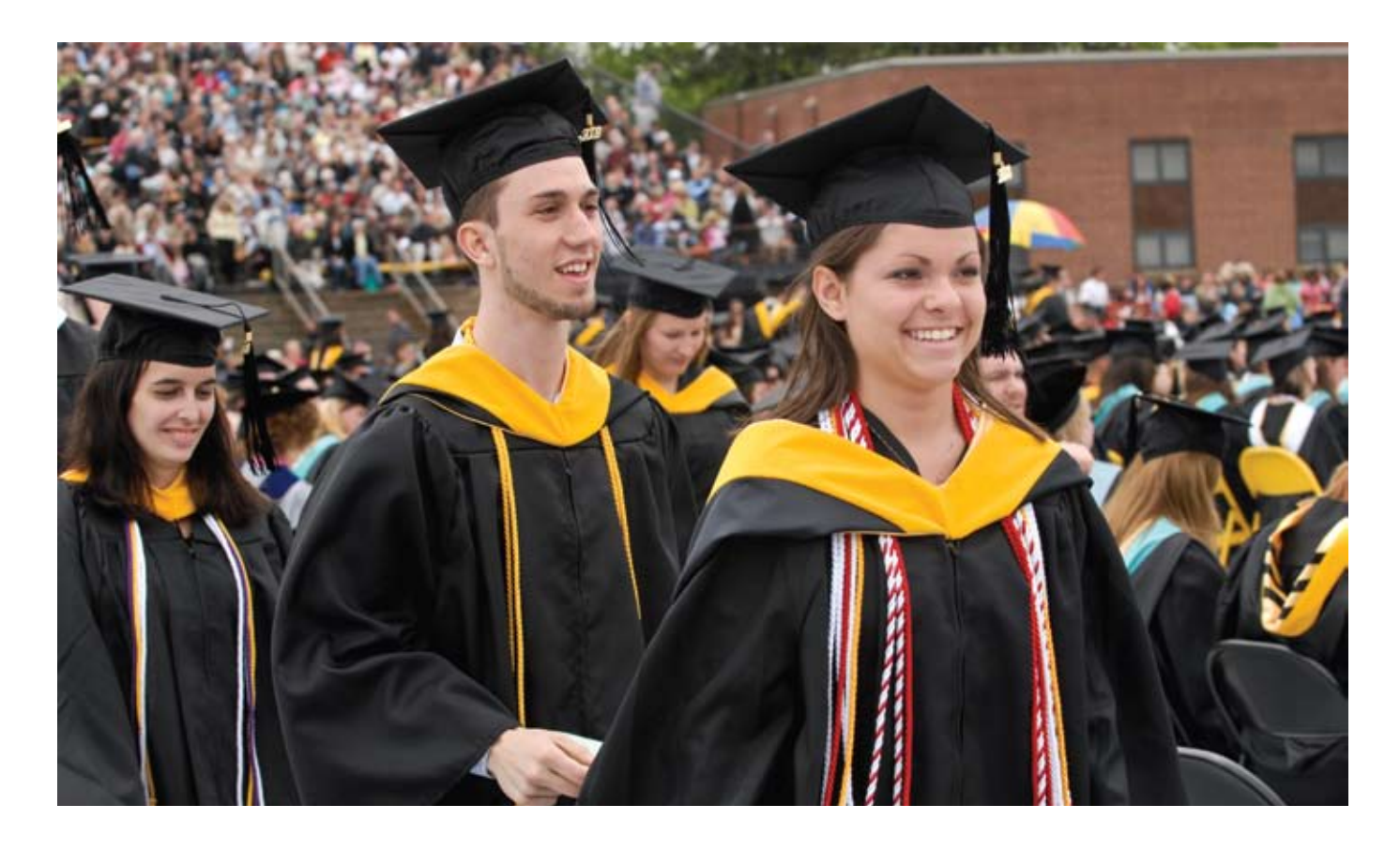
Admission & Finances