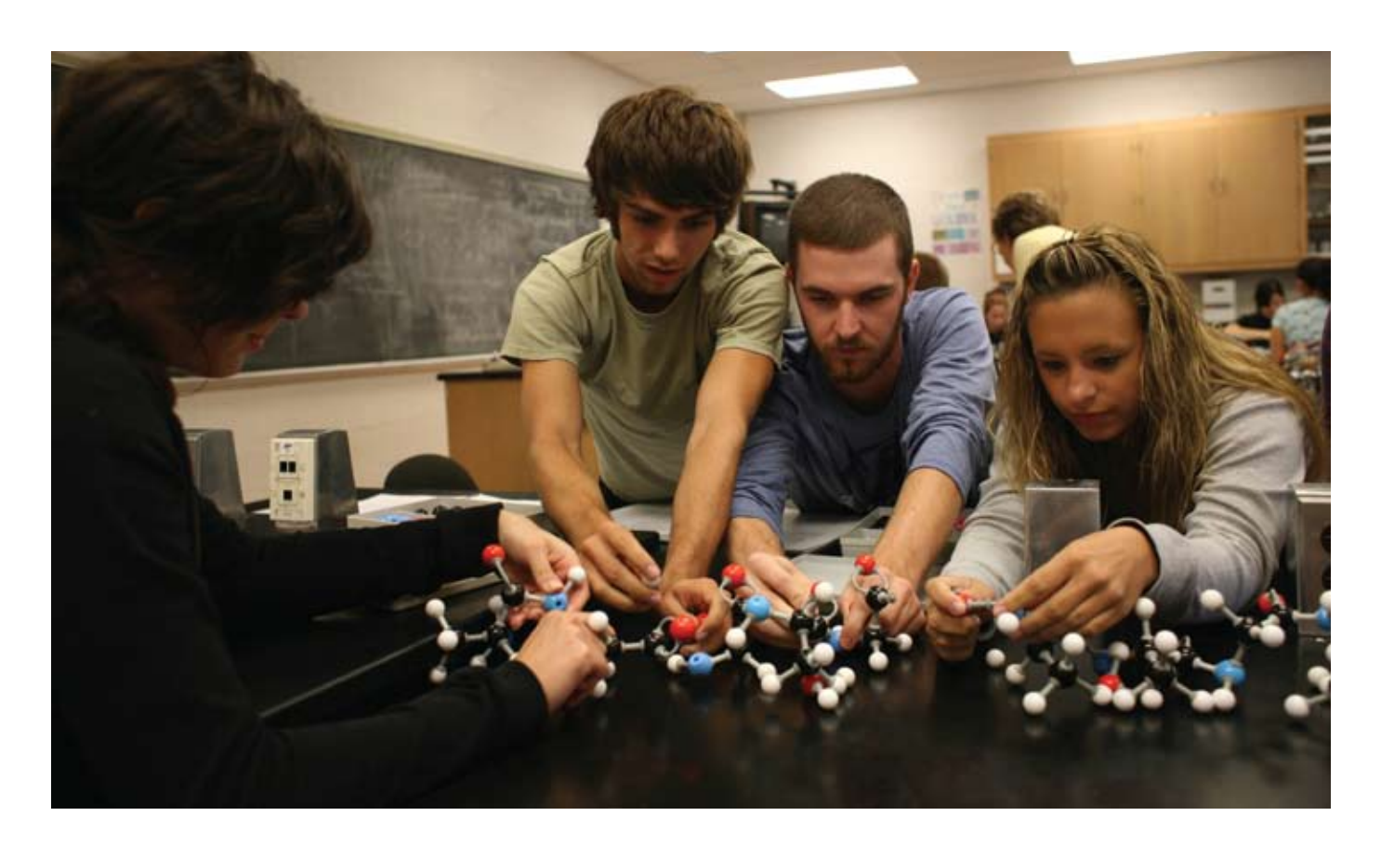
Academic Requirements, Opportunities & Policies