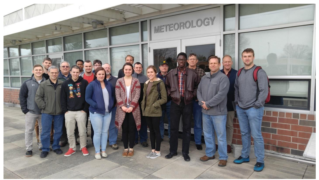
Attendees at the Unidata Regional Python and AWIPS CAVE Training Workshop held at Millersville University in April.