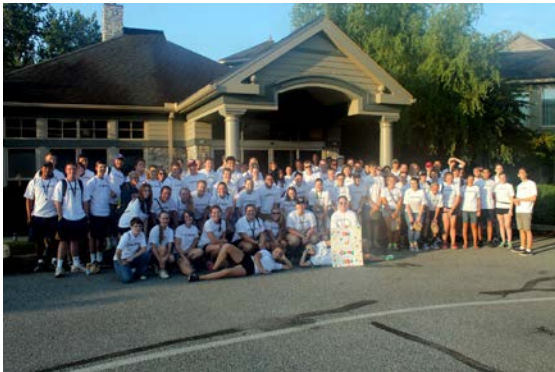
Group picture in front of Reighard Hall

Day of Caring 2014 was held on Saturday, September 6 beginning around 7:30 am. The Honors College had the largest student representation again this year!!