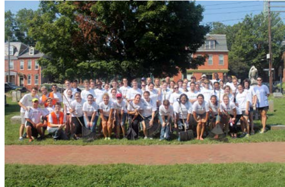
The group at the cemetery!