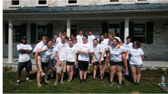
Another group of Honors students went to the Stoner House to assist in clean up there!