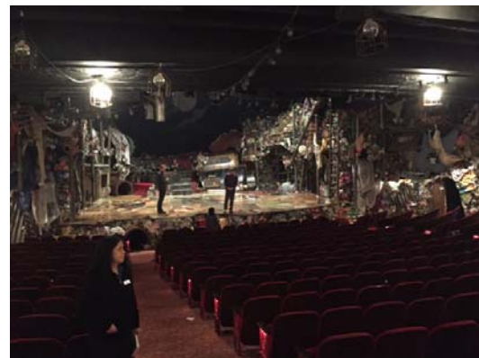
CATS stage and theatre