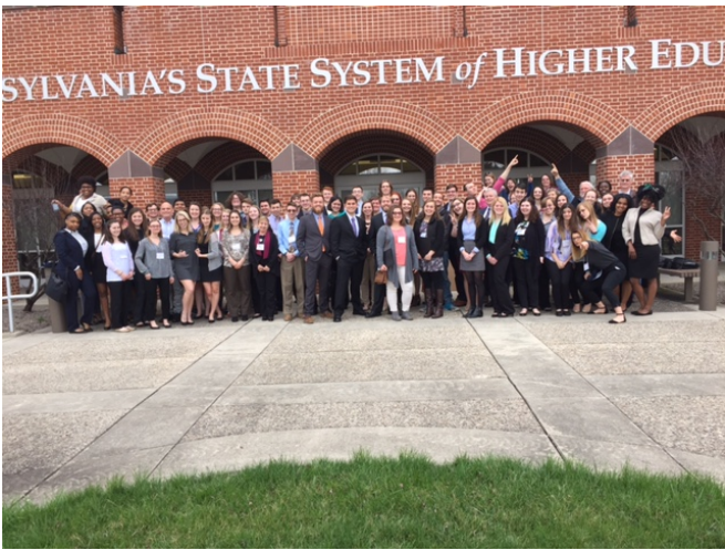
Students from PASSHE schools who attended the 2017 Student Leadership Conference