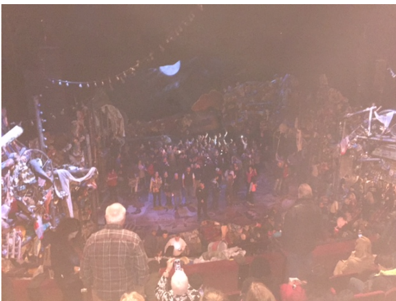
Cast of CATS