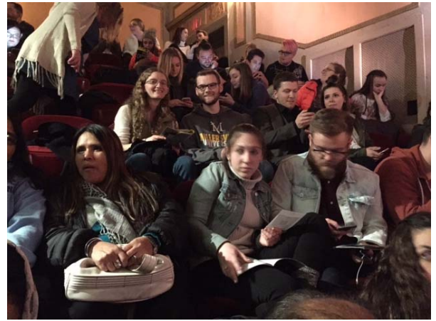
Some of the students at CATS