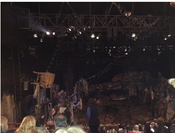
Neil Simon Theatre