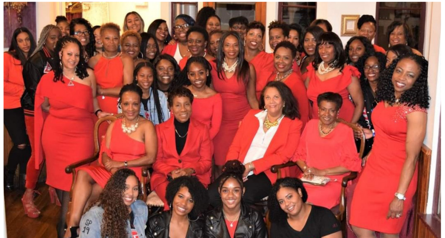
Members of the Lambda Gamma Chapter of Delta Sigma Theta Sorority Inc. celebrate their 45th Chapter Anniversary at Millersville University.

Divine Nine & Cultural Greek Council Unity Plots on Memorial Walkway located along Shenks Lane, near the Student Memorial Center.