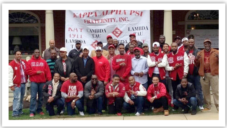
Alumni members from the Lambda Tau Chapter of Kappa Alpha Psi Fraternity Inc. return to campus for Homecoming reunions.