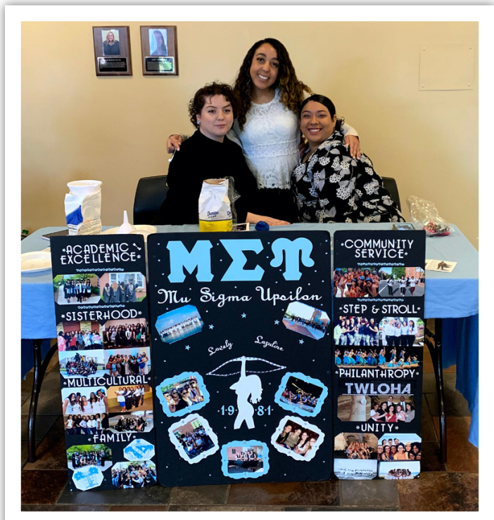
The Lazuline Chapter of Mu Sigma Upsilon Sorority Inc. on campus in the Student Memorial Center.