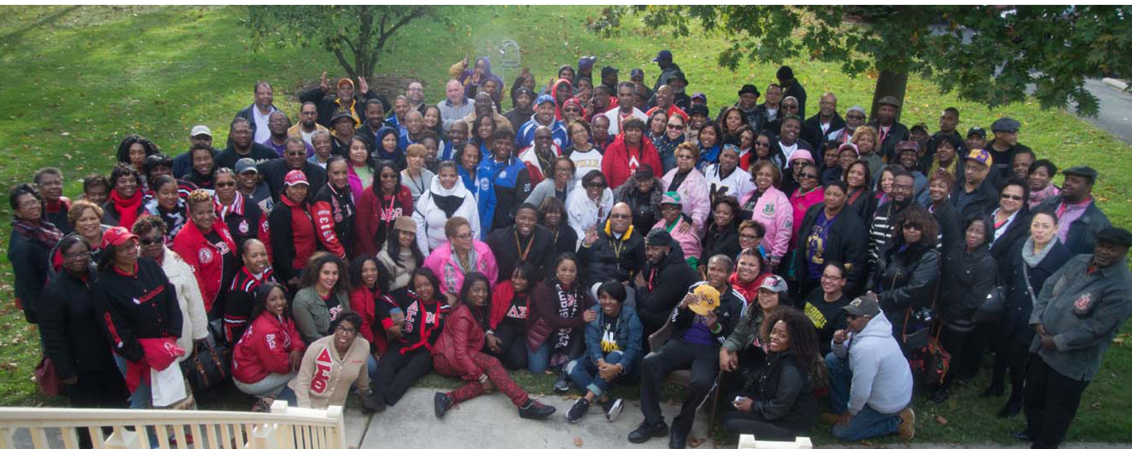
Homecoming events at the University bring alumni from many Greek organizations together to reconnect and celebrate.