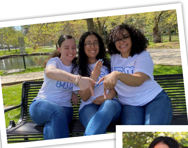
Members of the Lazuline Chapter of Mu Sigma Upsilon Sorority Inc. by the campus pond at Millersville University.