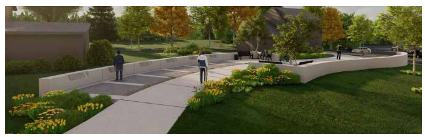
A gathering place for alumni and students to unite, celebrate and reflect will be established on the Millersville University campus with the Divine Nine & Cultural Greek Council Unity Plots on Memorial Walkway.

The Millersville University campus community and cultural Greek organizations celebrated a historic milestone during Homecoming weekend with the dedication of the Divine Nine & Cultural Greek Council Unity Plots on Memorial Walkway. The area will represent the physical and symbolic presence of each of the nine Greek sorority and fraternity organizations that is included in the National Pan-Hellenic Council, Incorporated (NPHC), plus Greek organizations of the National Multicultural Greek Council Inc. (NMGC) and the National Association of Latino Fraternal Organizations, Incorporated (NALFO). At