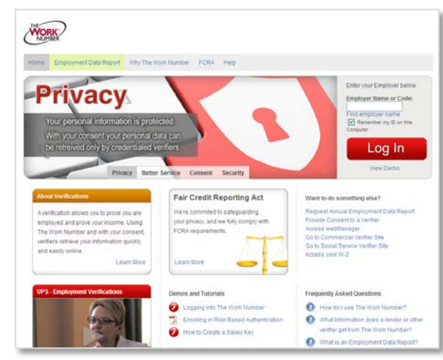
For more information, visit www.theworknumber.com/employees.

Note: In some instances, you might be asked to provide a Salary Key prior to verifying your income information. A Salary Key is a unique six-digit number that allows one-time access to your income data. In most cases you will have granted consent when signing an application and a Salary Key won't be needed, but if asked to provide a Salary Key, you'll find instructions at www.theworknumber.com or 800.367.2884.