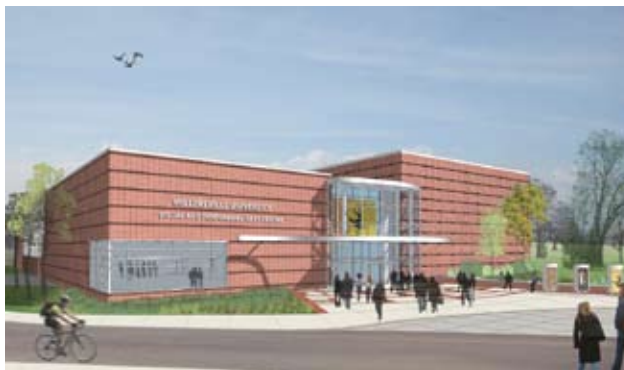
Current architect's rendering of the new visual and performing arts center.

"We'll need to get approval through Millersville Borough's Zoning Commission. We anticipate it will take about a year to get permits. We hope to complete the Frederick walkway