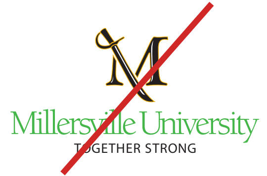
NEVER ADJUST/CHANGE COLORS