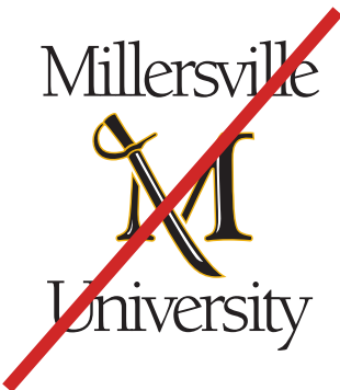
NEVER ALTER THE DESIGN