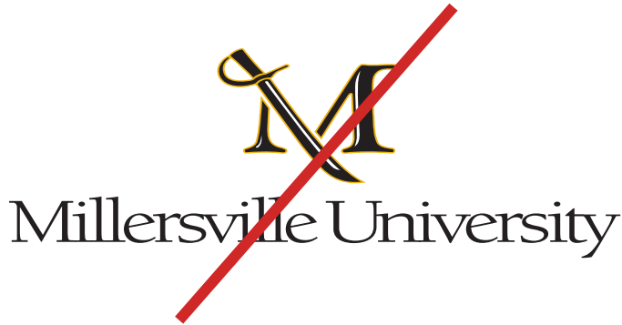
NEVER STRETCH OR SKEW

The Millersville University logo is a stand-alone design element—not words or parts of a statement—and must appear separate from other elements in all applications. To ensure brand integrity, it is imperative that no words or images crowd, overlap or merge with the logo. The logo is a registered trademark and may never be altered. Below are examples of brand violations to avoid.