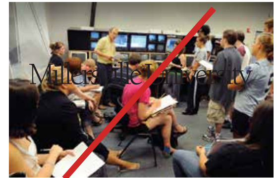
NEVER SACRIFICE LEGIBILITY