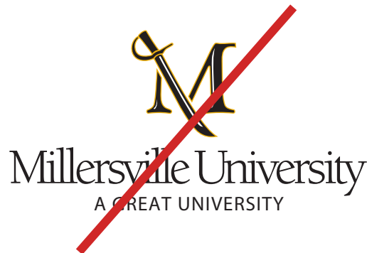
NEVER ADJUST THE TAGLINE