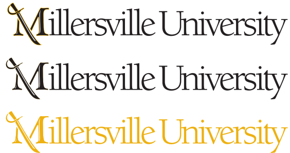
LOGO: HORIZONTAL USE

It is important to select a logo that best “fits” the environment and space where the logo will appear. The following logos were designed specifically to give designers some flexible options to best suit the overall design goals. Do not modify any of these logos.