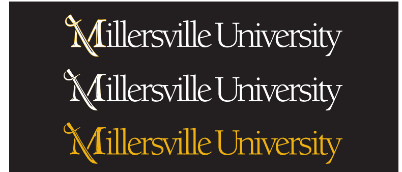
LOGO: RECTANGLE HORIZONTAL USE