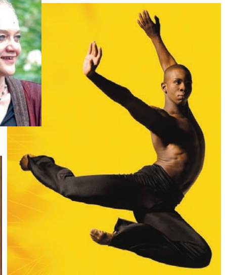
Ailey II Dance Company