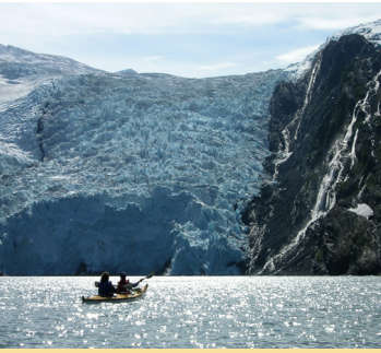
Geology club explores glaciers during a field trip to Alaska.