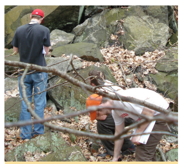
Geology field trips – a real pathway to learning.