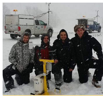
Meteorology students participate in a study of winter lake-effect snow events.

The Department of Earth Sciences has sustained solid growth since its founding. Each student follows a contemporary and comprehensive curriculum that reflects long-term trends in the scientific disciplines, while moving toward a more holistic, integrated earth systems approach so that our graduates gain the credentials needed to serve science and society in the 21st century. The department will remain dedicated to creating authentic learning experiences for students by exposing them to the latest scientific equipment and technology, both in the classroom and in research settings.