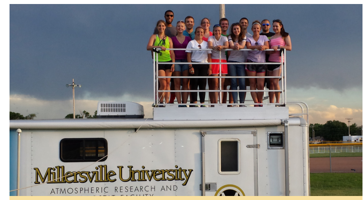
Meteorology students study nocturnal thunderstorms and other nighttime weather phenomena in Kansas. What do you want to do as an undergraduate?

All 10 full-time faculty have earned their doctoral degrees. Together, they reflect a diversity of expertise that covers the various disciplines of earth sciences.