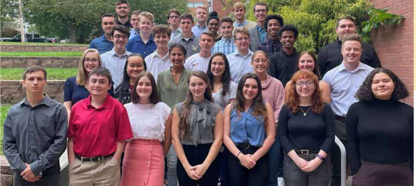
The student members of the 2021-2022 student group of the Marauder Fund Student Investment Association receive valuable hands-on experience through their student managed investment portfolio.

The mission of the Marauder Fund Student Investment Association (aka: The Marauder Fund, MFSIA, or MF) is to expand the economics and financial market educational experiences of its student members by promoting and sponsoring workshops, seminars and career development events based on financial markets and investing. A component of the MFSIA is a student managed investment portfolio (The Marauder Fund) that provides students with hands-on investment experience.