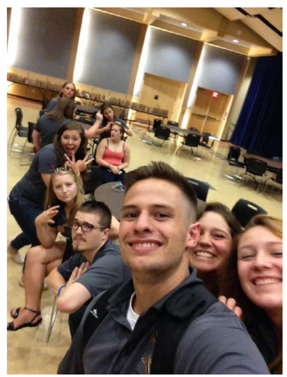
Some of the 2016 Orientation Leaders