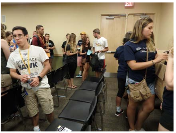
Picking up Freshmen Bags.