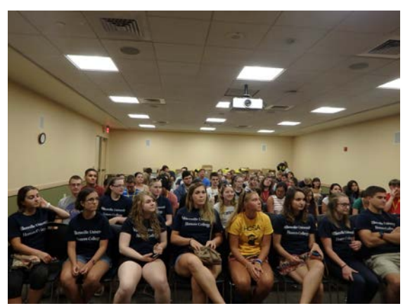
HCSA members with our newest Honors freshmen.