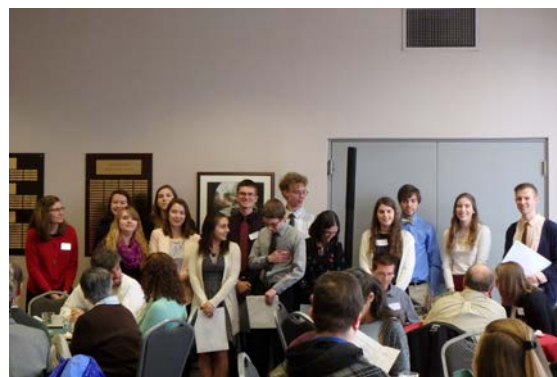
Honors Students with awards