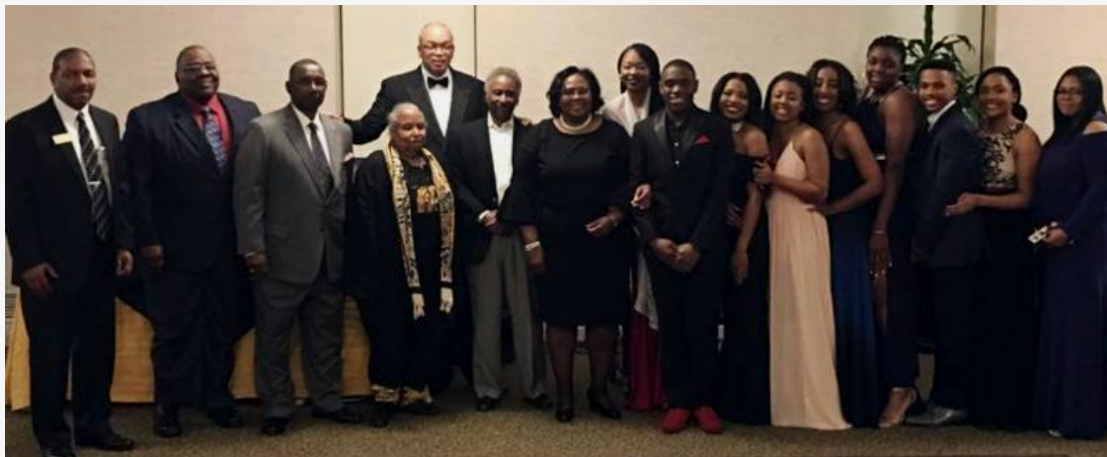
BSA/BSU 50th Anniversary Celebration - In Review

*You can earn 1.5% Cash Rewards on purchases. "With checking and one or more qualifying Direct Deposits, you can earn 2%. See the PSECU Visa® Founder's Card Rewards Program Terms and Conditions on psecu.com/disclosures for full details.