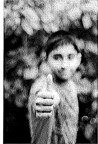
You’re using a growth mindset? Right on.

FIXED MINDSET: “If you don’t try, you can protect yourself and keep your dignity.”