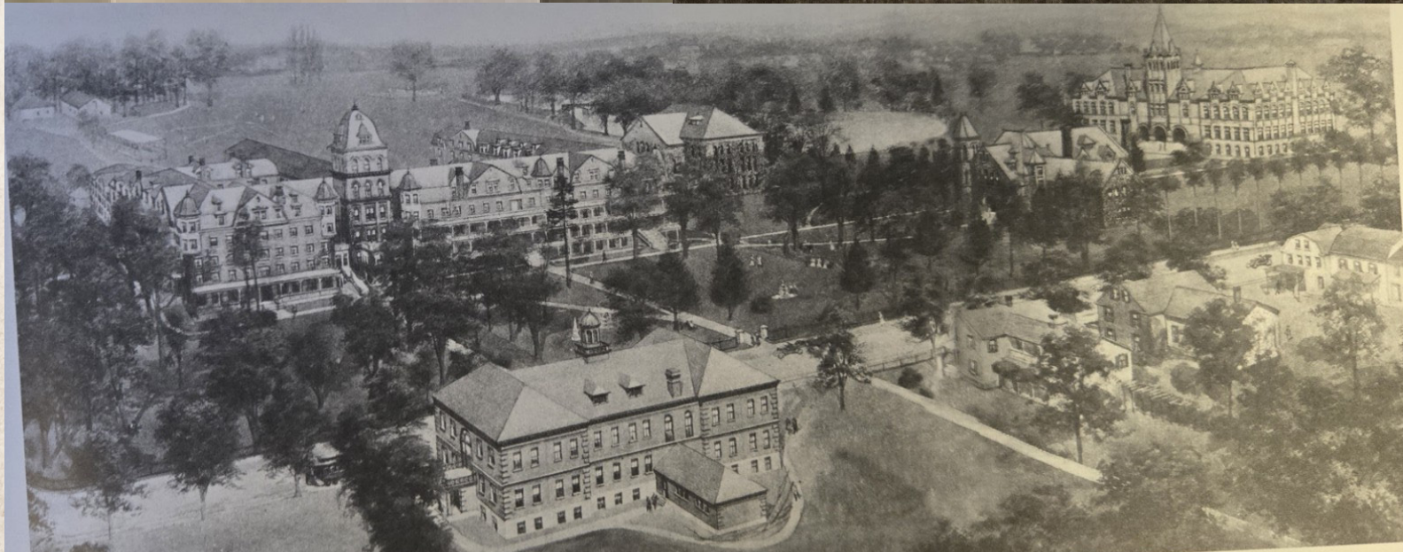
Top Left: Senior First Class of 1899 , Top Right: Students and Faculty 1879 Bottom: A Sketch of Campus around 1900