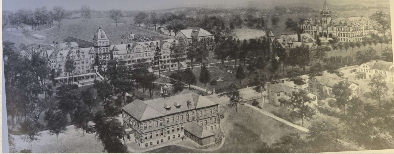
Top Left: Senior First Class of 1899 , Top Right: Students and Faculty 1879 Bottom: A Sketch of Campus around 1900