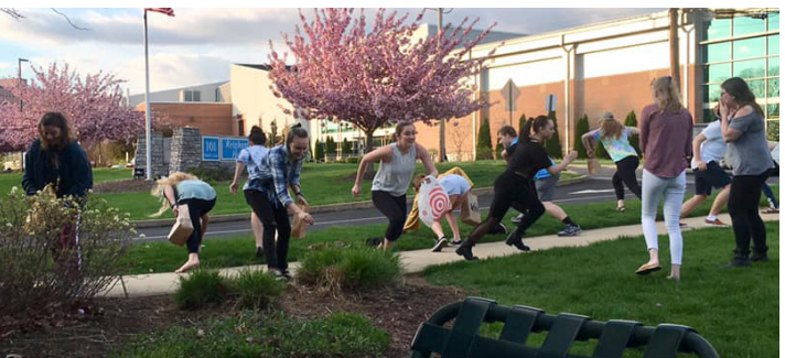
Honors College Egg Hunt