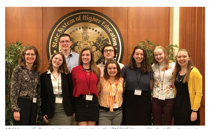
MU Honors College students participate in the PASSHE Honors Student Development Conference at the Dixon Center in Harrisburg

Admission to the University Honors College is select and offered to students who demonstrate they have the intellectual skills to succeed in a more challenging program of study. Normally, students who have been offered admission to the University and are in the upper 10-15% of their graduating class, have a GPA of 3.5 or above during high school or have a combined SAT score of 1200 or higher will be encouraged to apply for admission to the University Honors College. Although grades, SAT scores and class rank are considerations for admission to the Honors College, the program is also looking for students who are willing to be active participants and leaders.