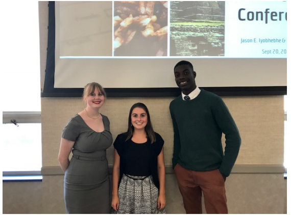
Thank you for a job well done!!