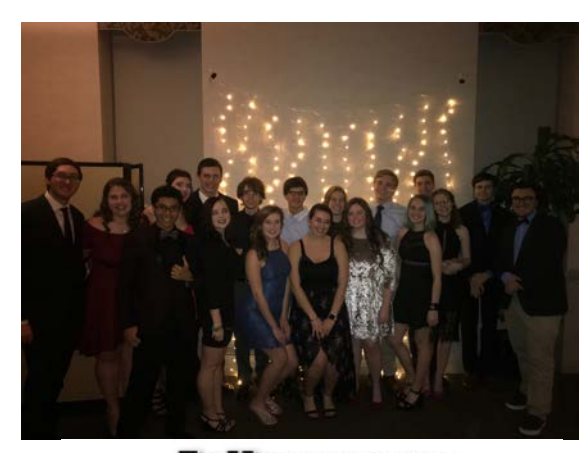
Follow us on