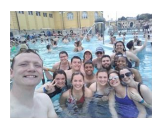
PASSHE STUDY ABROAD