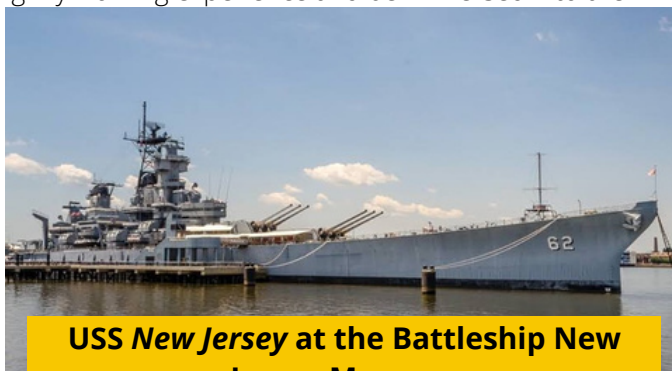
USS New Jersey at the Battleship New Jersey Museum