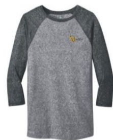
06. Baseball 3/4 Sleeve T-shirt $18.00 Select