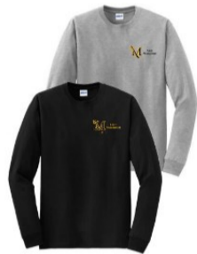
02. Long Sleeve Cotton Blend T-shirt $13.00 Select