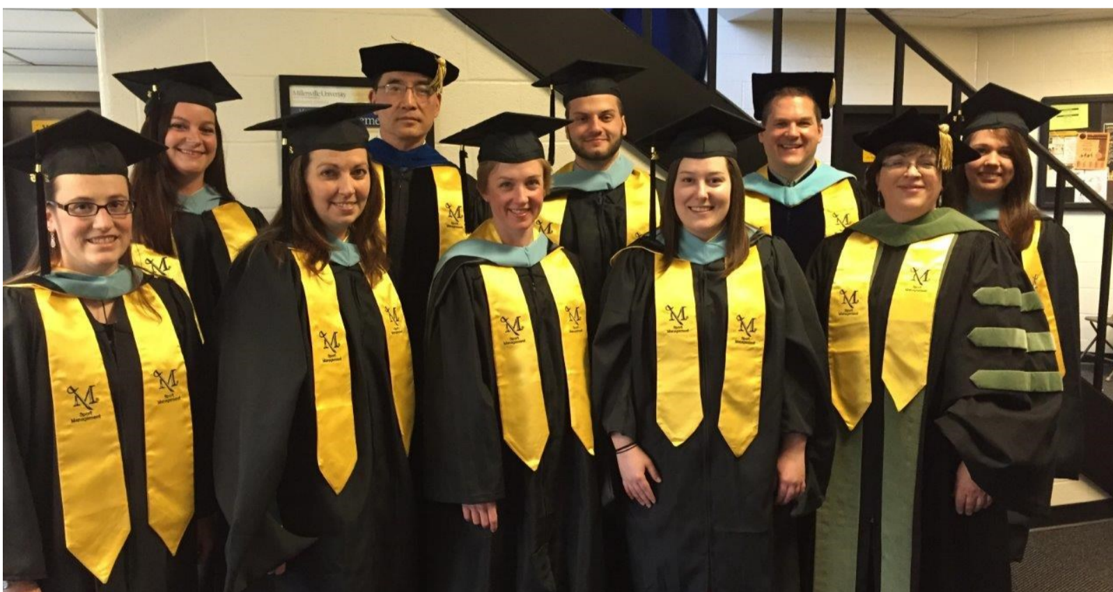
May 2016 Graduates