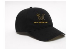
04. Adjustable Hat $12.00 Select