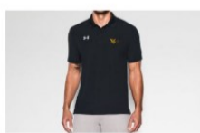
17. Under Armour Polo $44.00 Select