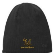
13. Knit Beanie $13.00 Select