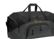
16. Duffle Bag $24.00 Select