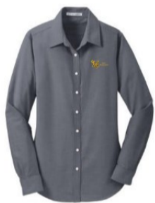
09. Ladies Cotton Blend Button Down $28.00 Select