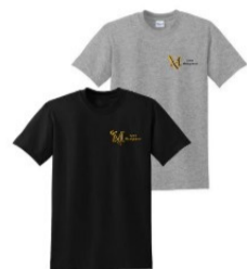
01. Cotton Blend T-shirt $9.00 Select

Orders placed by May 29th will be processed together and completed the week of June 12th