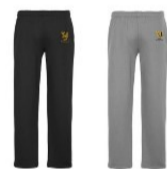
11. Cotton Open Bottom Sweatpants $18.00 Select