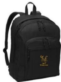
14. Backpack $20.00 Select