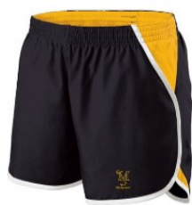
18. Ladies Shorts $22.00 Select

An online store will be made available at ( https://www.agpestores.com//ESGSports/groupproducts.php?prodgroup_id=1680&prodgroupbypass=true )