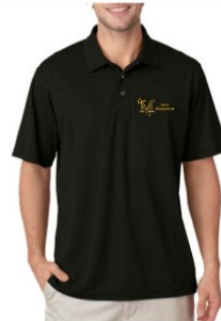
03. Polo $20.00 Select