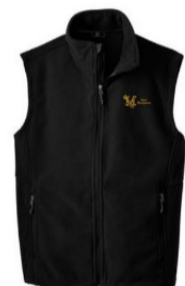
10. Fleeve Vest $26.00 Select