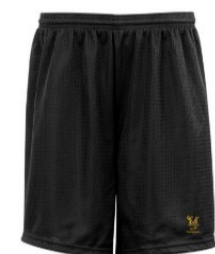
12. Mesh Shorts $12.00 Select