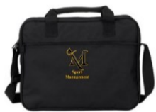
05. Portfolio Bag $17.00 Select