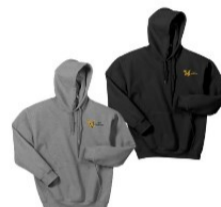
07. Cotton Hooded Sweatshirt $16.00 Select