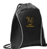
15. Cinch Bag $10.00 Select