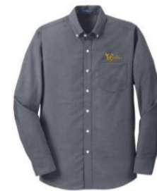
08. Men's Cotton Blend Button Down $28.00 Select